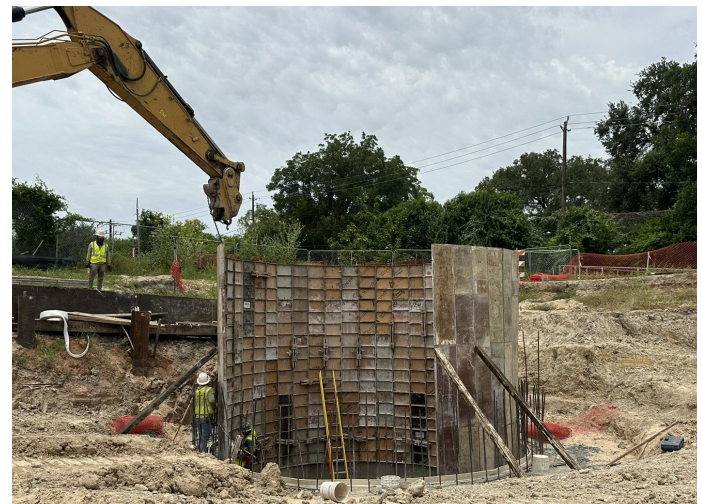
Formwork for Wet Well Top