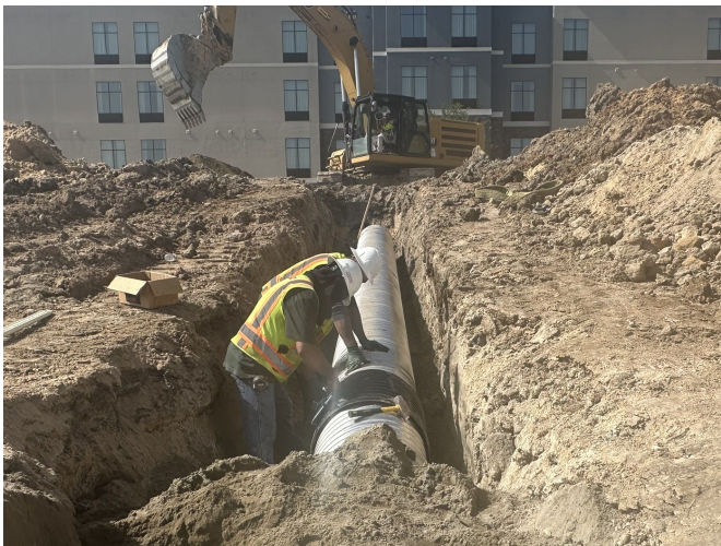
Backslope Interceptor Pipe Installation