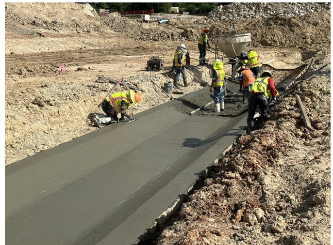
Concrete Pilot Channel