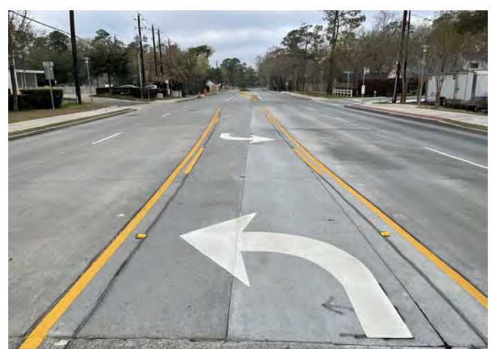
Pavement Marking / Striping