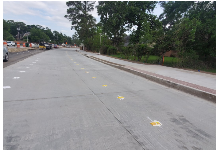
New Concrete Pavement