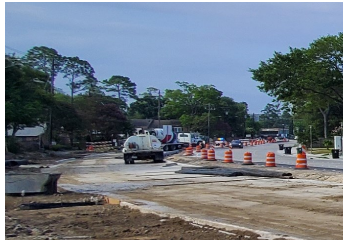
Traffic Control Configuration