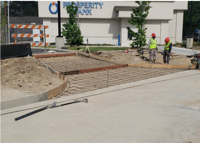
Driveway framework installation in progress