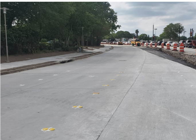
New concrete pavement