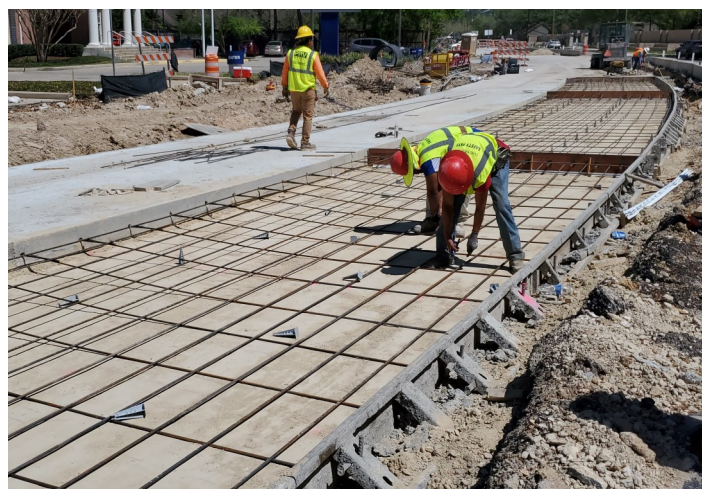
Concrete framework installation in progress