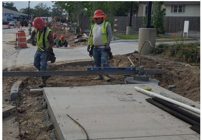
Sidewalk installation in progress