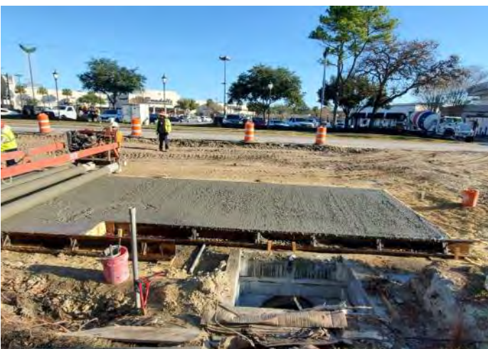
Concrete roadway installation in progress