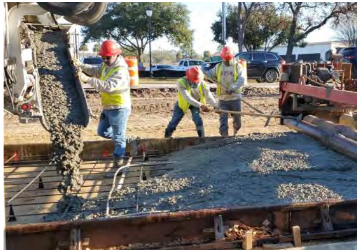
Concrete pour in progress