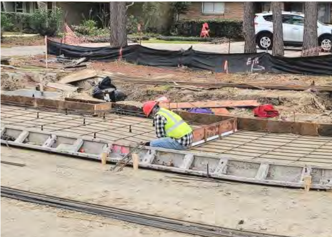
Roadway framework installation in progress