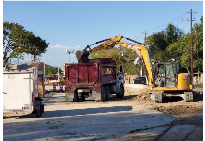
Roadway Excavation in progress