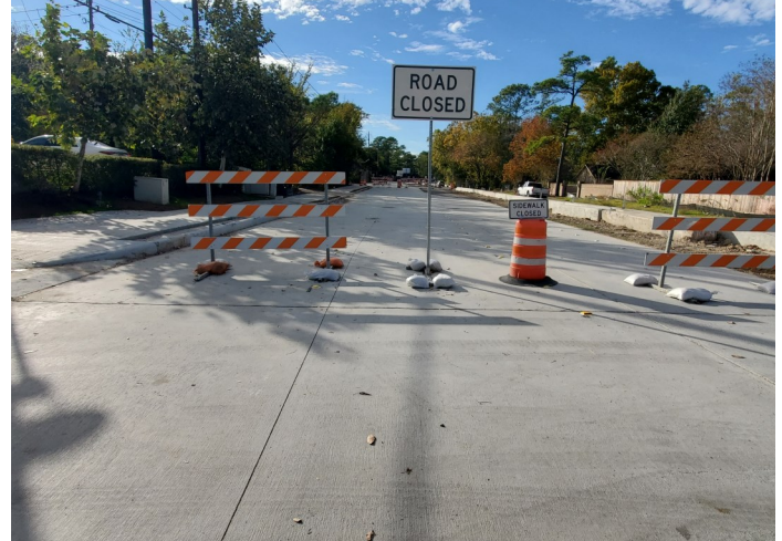
Traffic Control configuration