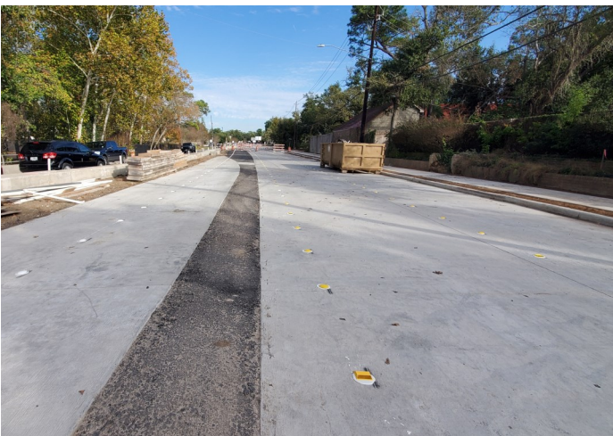
Roadway construction in progress