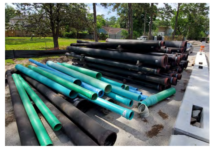
Water line & Sanitary line Stockpile