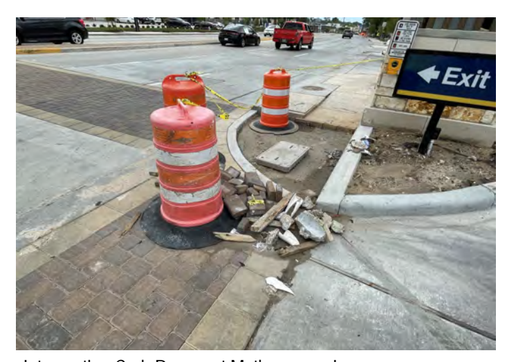
Intersection Curb Ramps at Mathewson—In progress