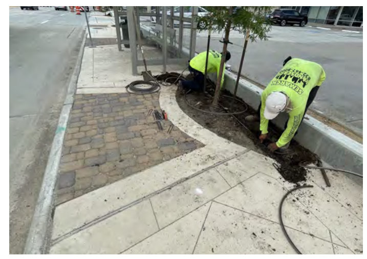
Irrigation system work—In progress