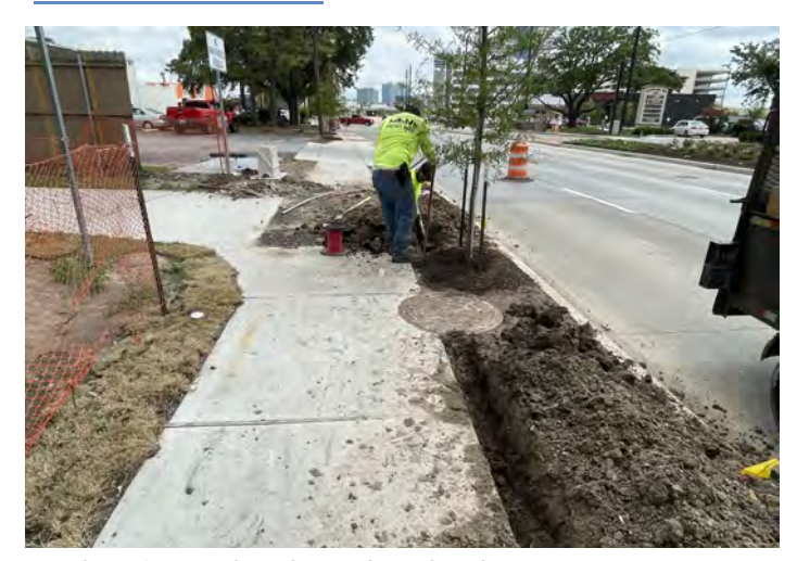
Landscaping Work—Almost Completed