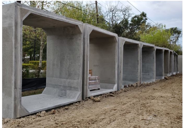
10-ft x 10-ft Storm Sewer RCB Stockpile