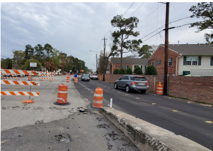
Current Traffic Control Configuration