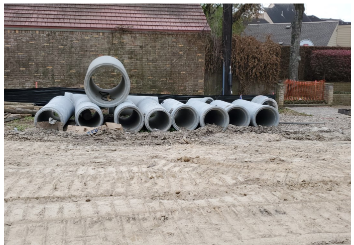
Storm Sewer RCP Stockpile