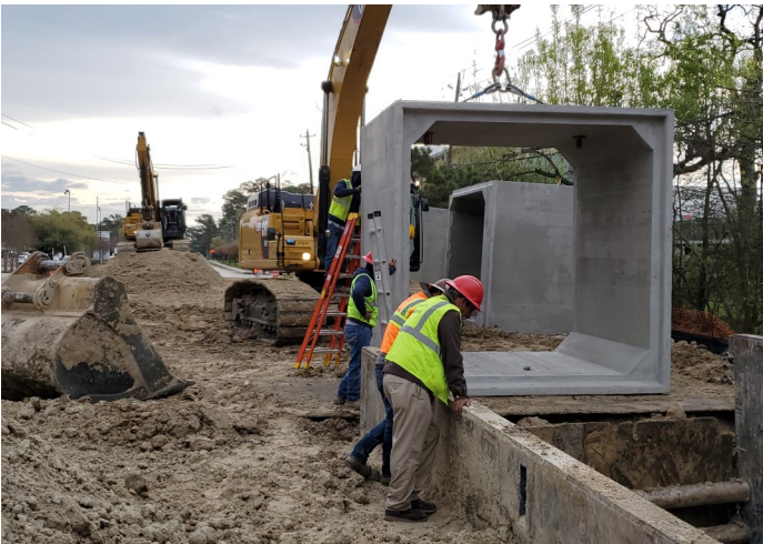
10-ft x 10-ft Storm Sewer RCB installation at W153