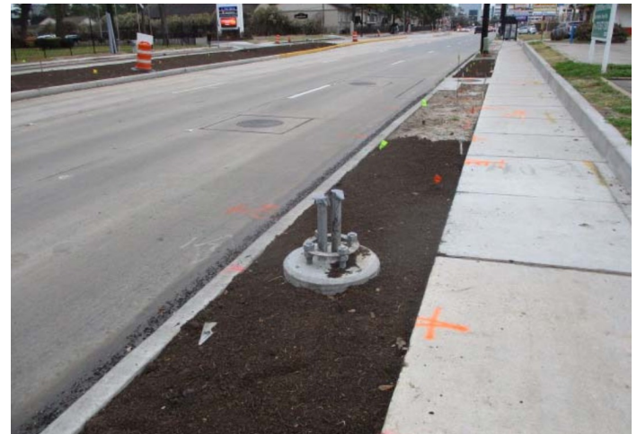
Street Light Foundations—In progress