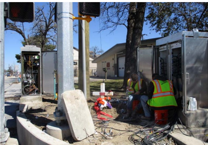
Wiring Traffic Signal Controllers at Westview Drive