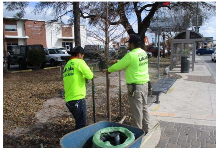
Bald Cypress Trees Installation—In progress