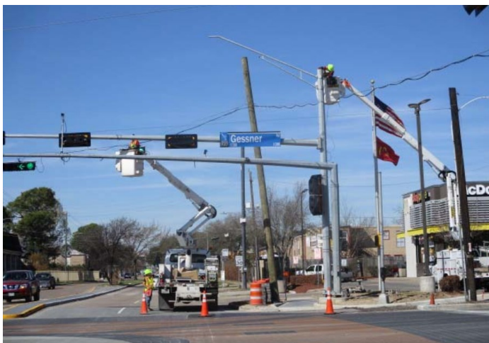
New Traffic Signal at Westview Drive