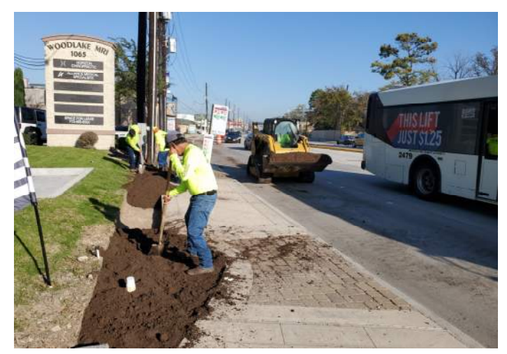
Landscaping and Irrigation Meters Installation in progress