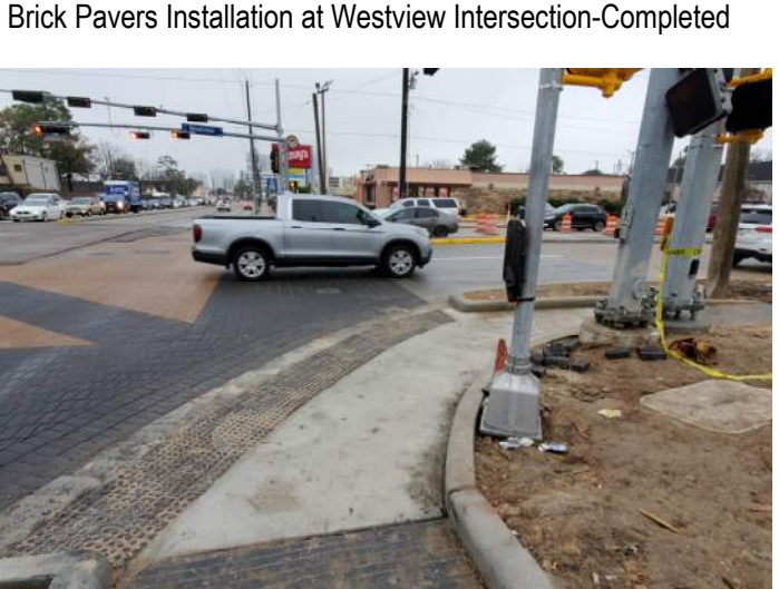
Truncated Domes at Westview Intersection—Completed