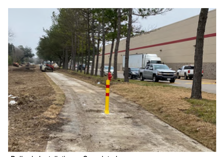
Bollards Installation —Completed