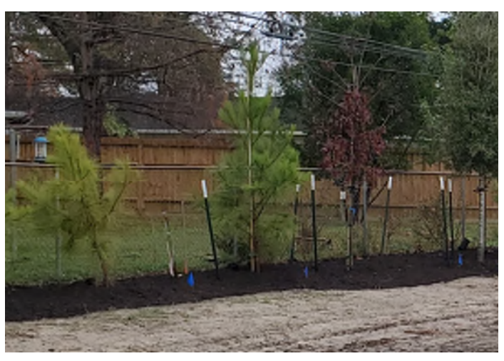
Landscaping / Trees Installation —Completed