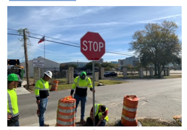
Signs Installation at Witte Rd—Completed