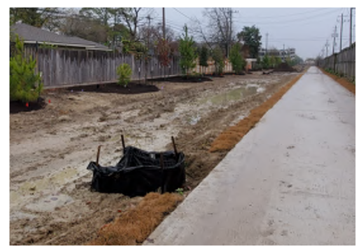
Erosion Control & Soil Remediation— In Progress