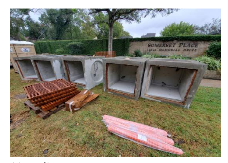
Inlets on Site