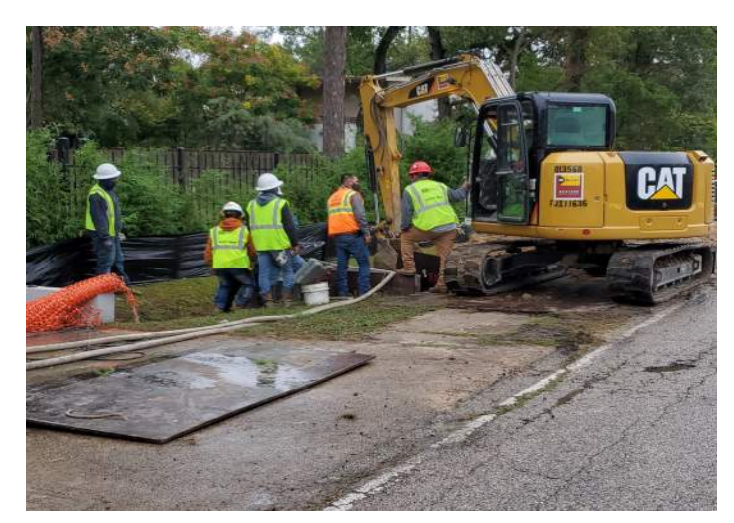
Water Line Pipe Installation