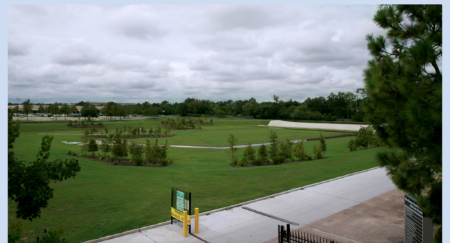
Briar Branch Detention Basin