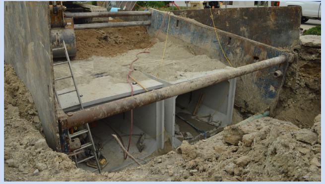
Barryknoll Roadway Improvements - Dual 8 FT x 6 FT Box Culvert installation