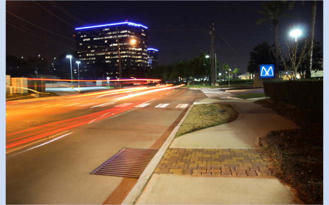
Barryknoll Roadway Improvements - Completed Project