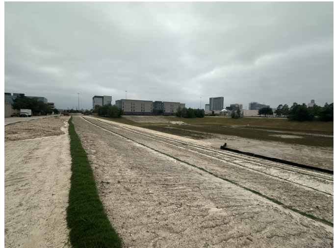
Sod Strips in Basin