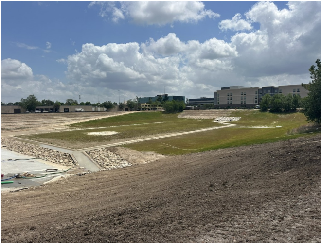
Vegetative Growth in Basin