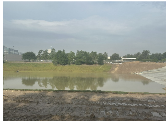
Basin with Rainwater