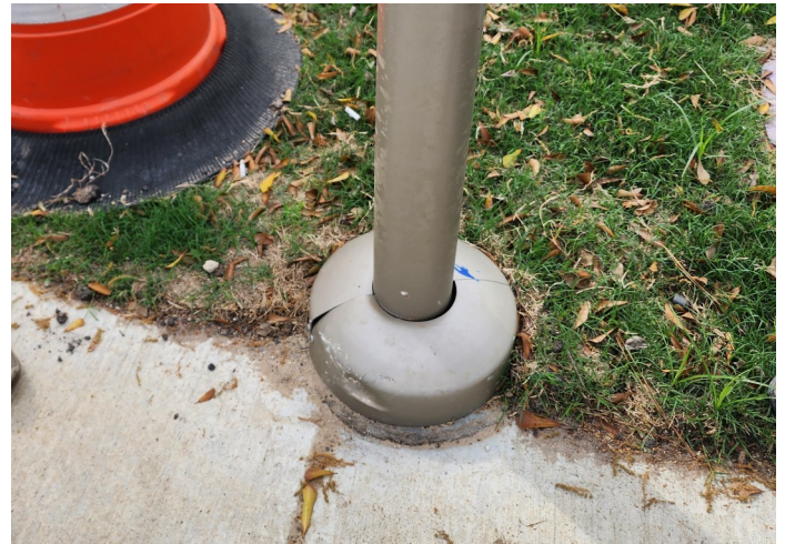
Included on punch list items to be fixed.