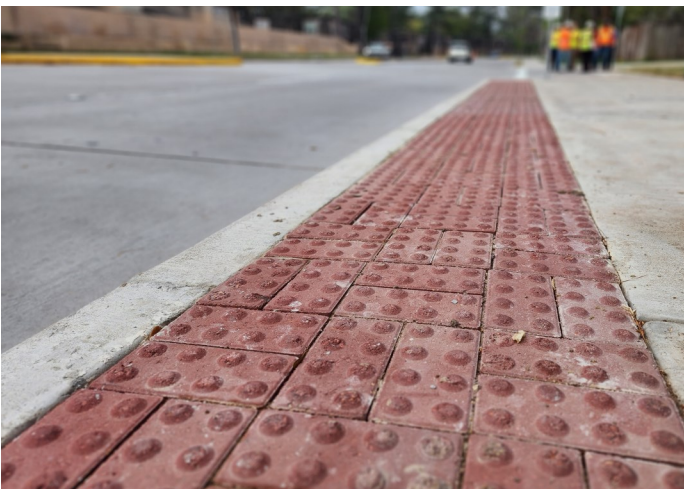
BOOST level improvements at Bus Stop.