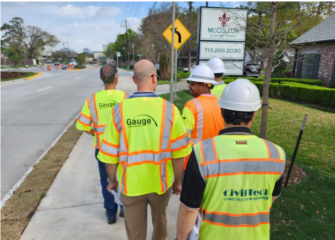
TxDOT, City, TIRZ 17, CM and Gauge personnel.