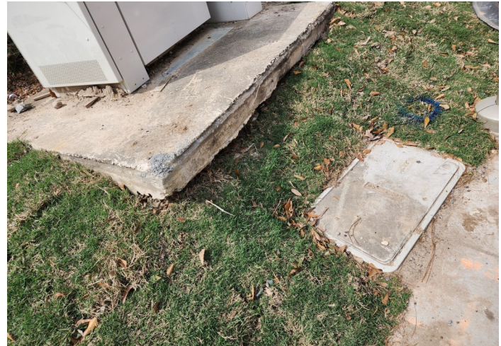
Included on punch list items to be fixed.