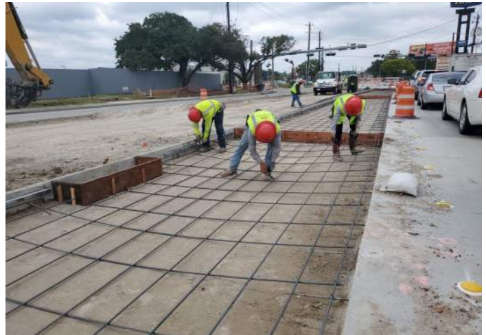
Forming work for inner travel lane (Phase 5) on east side.