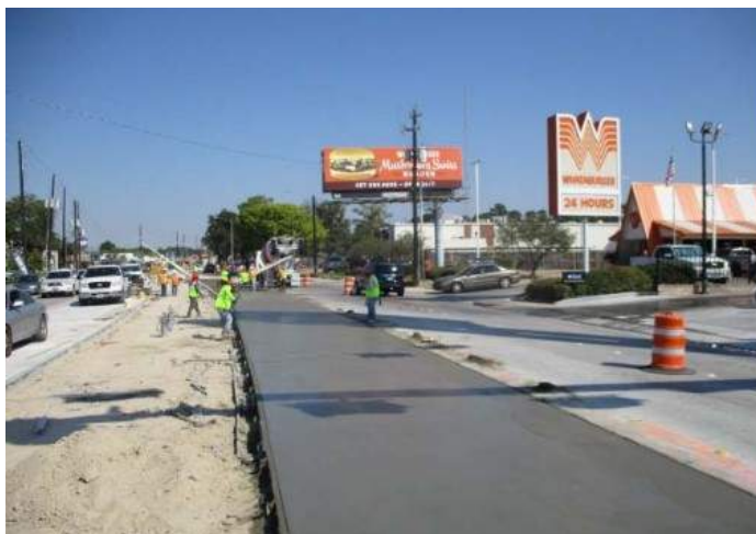
Concrete pavement for inner lanes