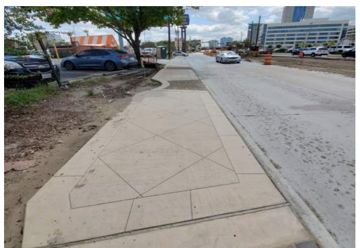
Sidewalk work ongoing on east side.