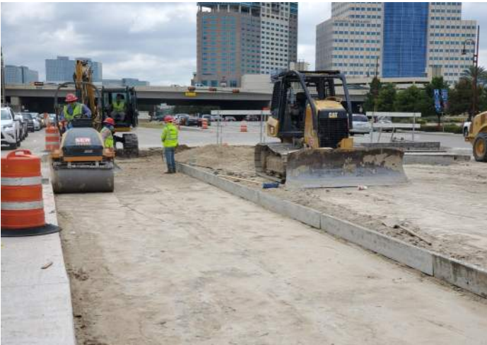
Soil compaction for travel lane - Phase 5