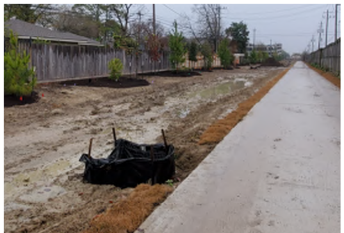
Erosion Control & Soil Remediation— In Progress