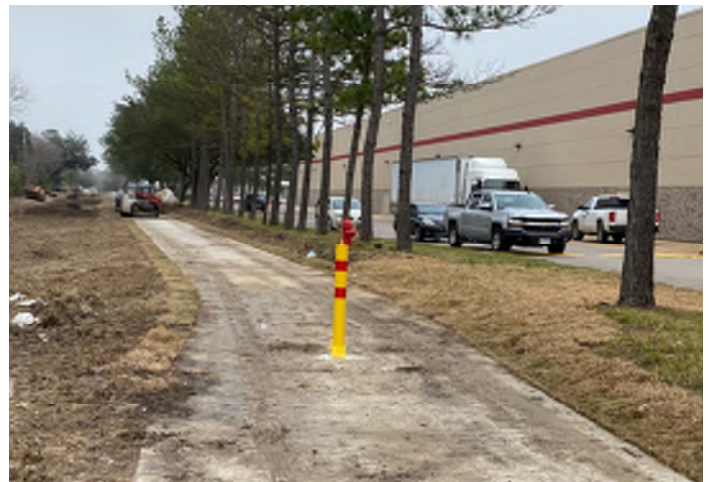
Bollards Installation —Completed