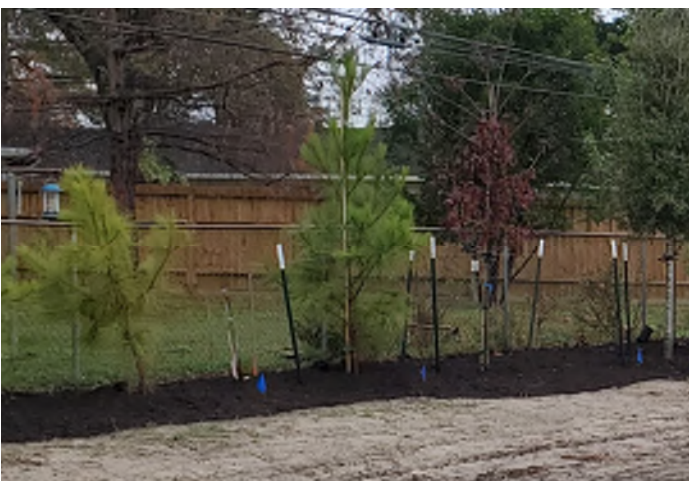
Landscaping / Trees Installation —Completed