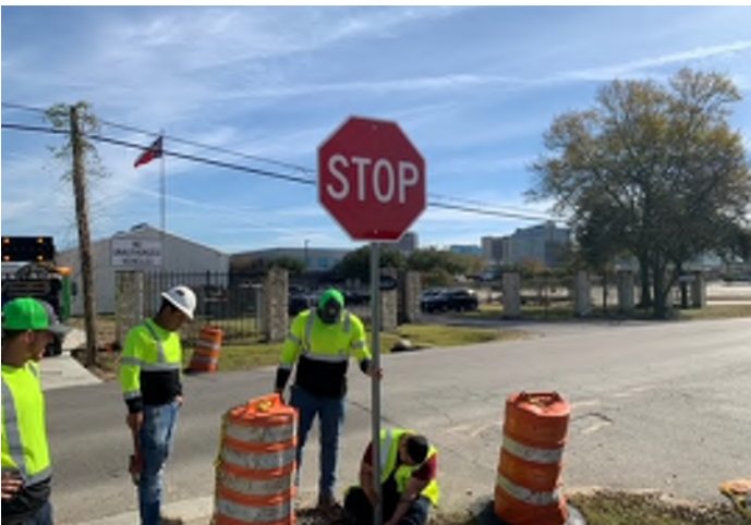
Signs Installation at Witte Rd—Completed