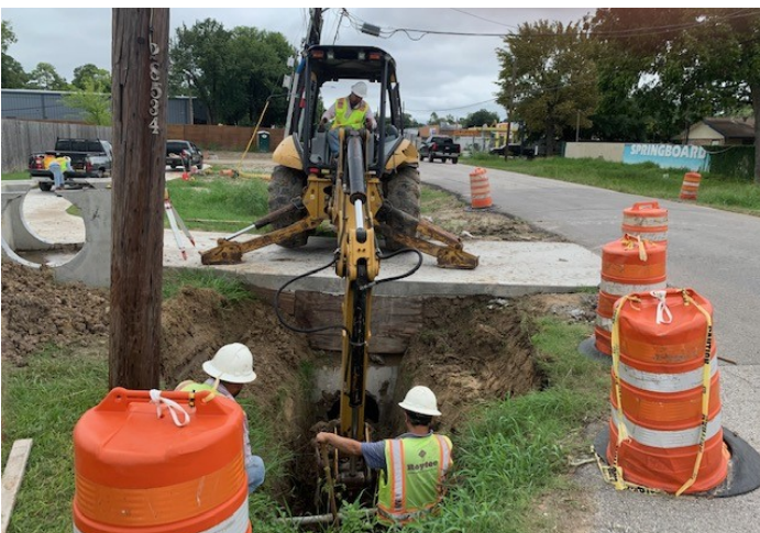
Setting Inlet on Witte Road next to Access Road.