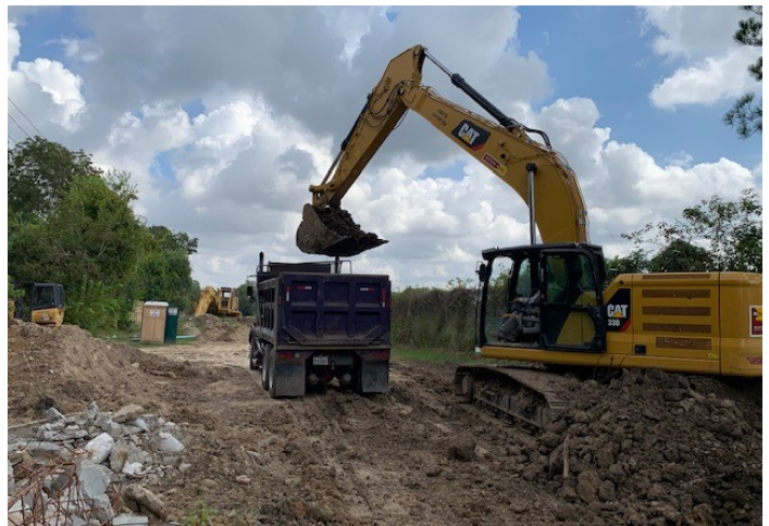
Loading Spoils into Trucks for Last Section of Access Road