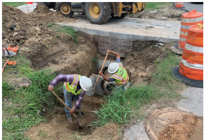
Backfilling Inlet Box at Witte Rd.