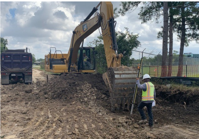
Cutting Grade for last section of Access Rd