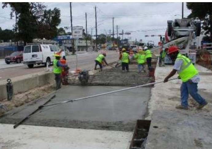
Concrete Pour on Northbound Lane 2.