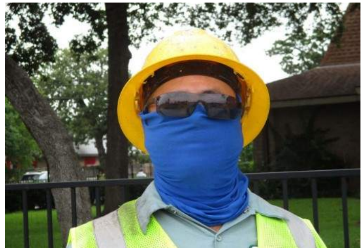
SER workers continue to comply with COVID-19 Guidelines.