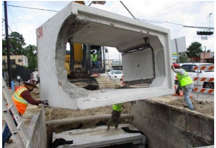
RCB installation on the east side of Gessner Rd