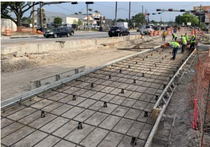
Forming work for pavement installation on east side.