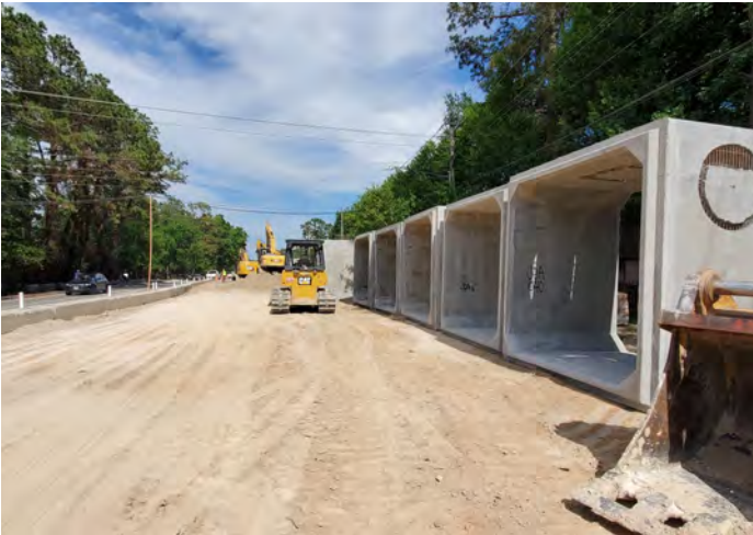
10-ft x 10-ft Storm Sewer RCB Stockpile