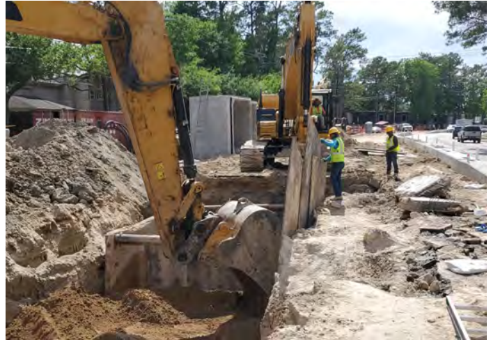
10-ft x 10-ft Storm Sewer RCB Installation