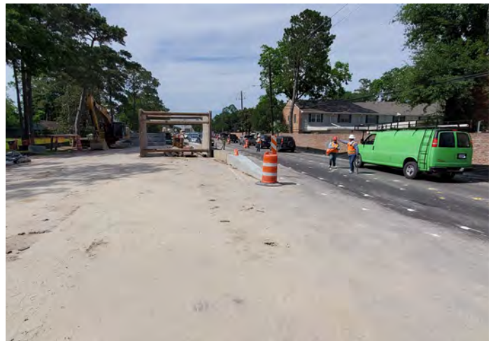
Traffic Control setup