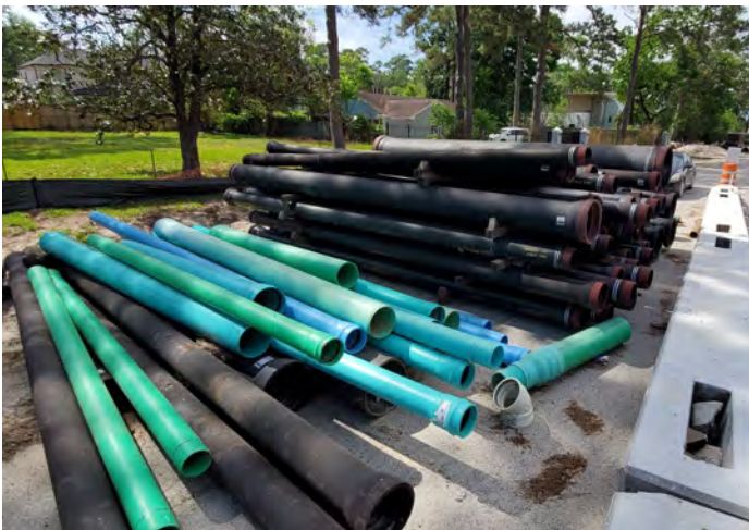
Water line & Sanitary line Stockpile