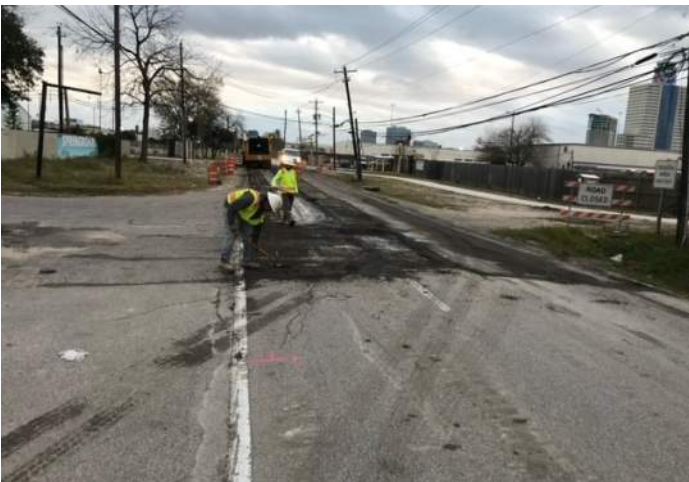
Mill and Overlay Work at Witte Rd