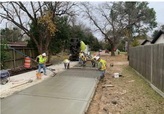
Repairing Concrete Pavement at Confederate Rd