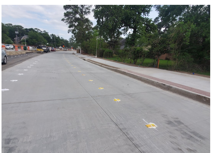
New Concrete Pavement