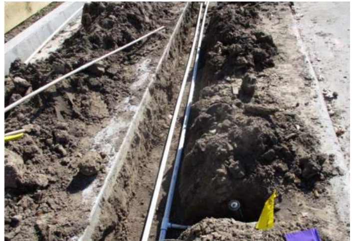
Irrigation System installation