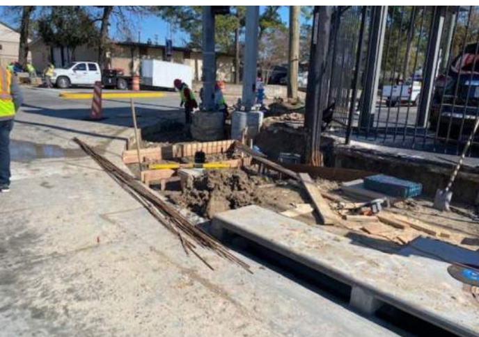
Frame Work for Sidewalk –SE corner of Westview inter section