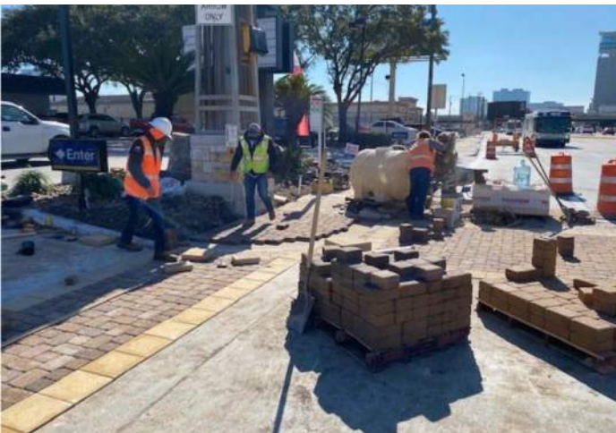
Brick Pavers Installation