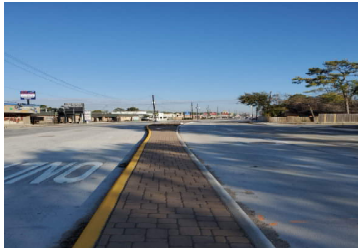
Removed barrels / Barricades, Opened all NB&SB Traffic lanes