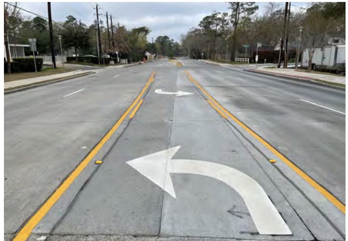
Pavement Marking / Striping