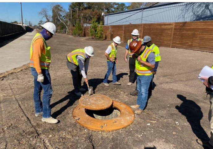
Substantial Completion Walkthrough with City staff