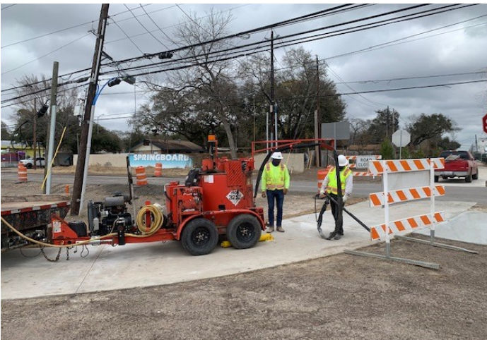
Applying sealant to Access Road