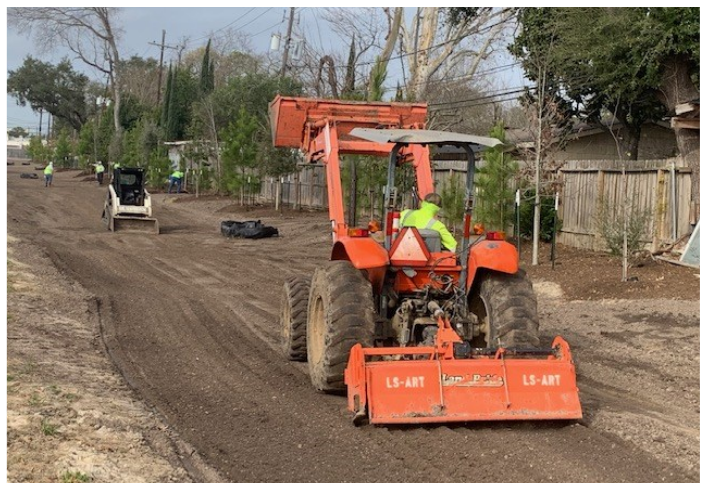
Spreading top soil