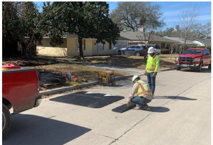
Installing road cushions on Long Branch