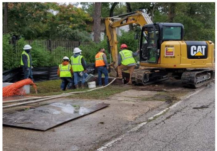
Water Line Pipe Installation