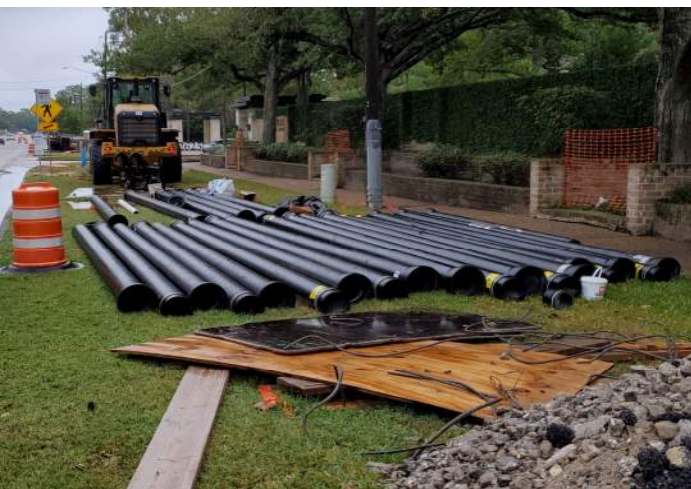
Water Line Pipes