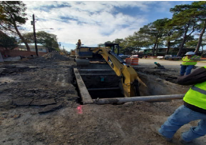
24" Sanitary Sewer installation