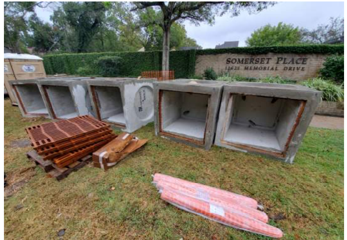
Inlets on Site