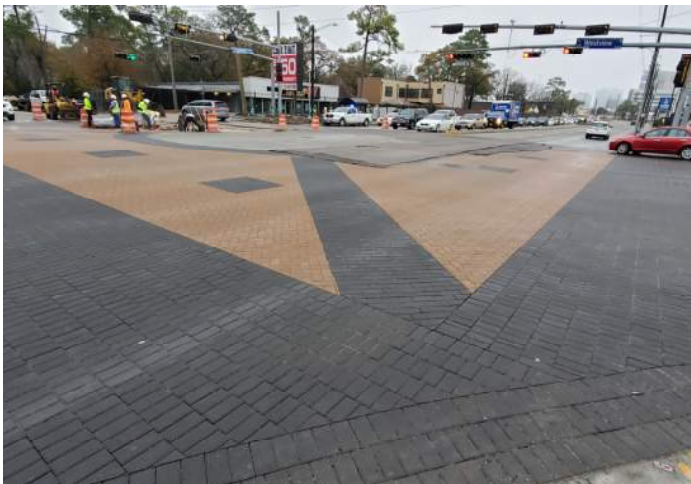
Brick Pavers Installation at Westview Intersection—Completed