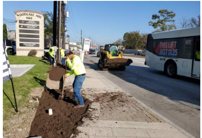
Landscaping and Irrigation Meters Installation in progress