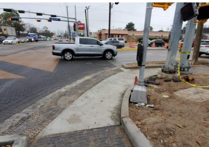
Truncated Domes at Westview Intersection—Completed