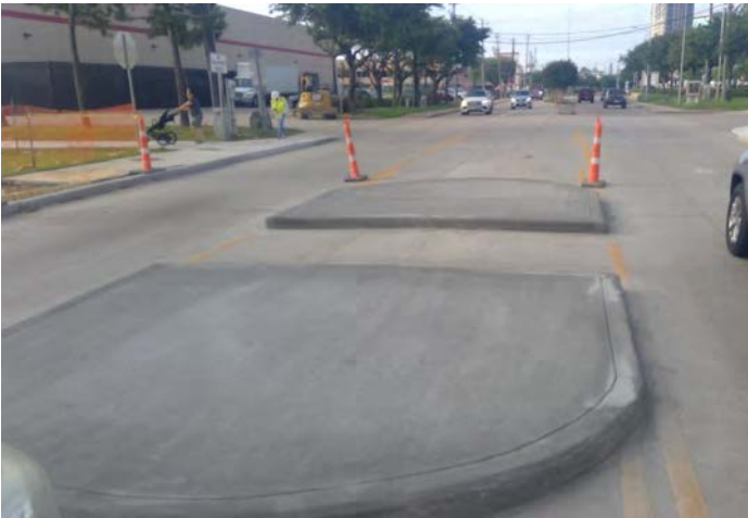
Crosswalk Island Completion - Bunker Hill Rd