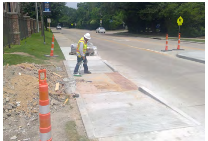
Ramp Work Completed—Bunker Hill Rd