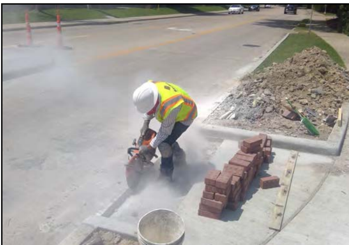
Truncated Domes Installation - Bunker Hill Rd