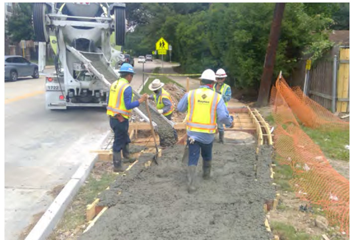
Concrete Pour for sidewalk - Bunker Hill Rd