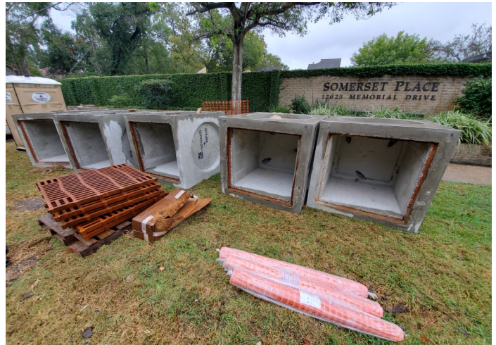
Inlets on Site