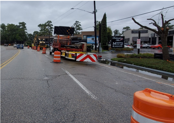
Current traffic control configuration