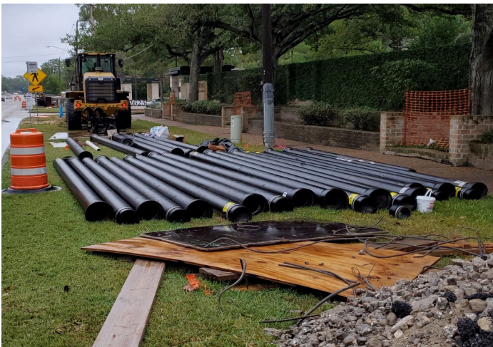
Water Line Pipes