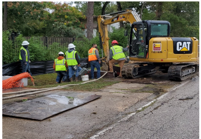
Water Line Pipe Installation