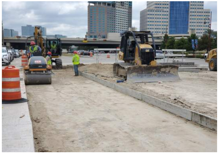
Soil compaction for travel lane - Phase 5