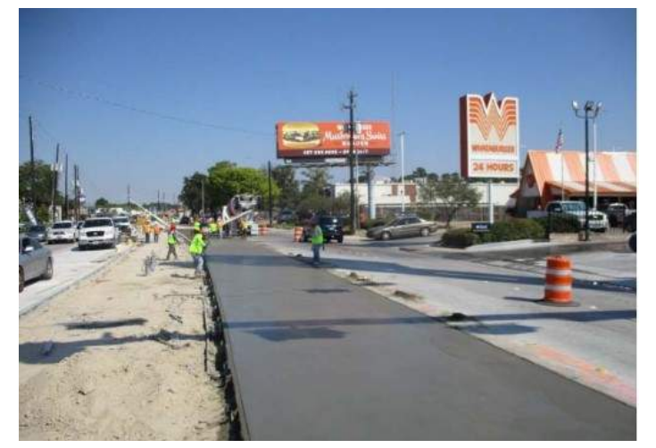
Concrete pavement for inner lanes