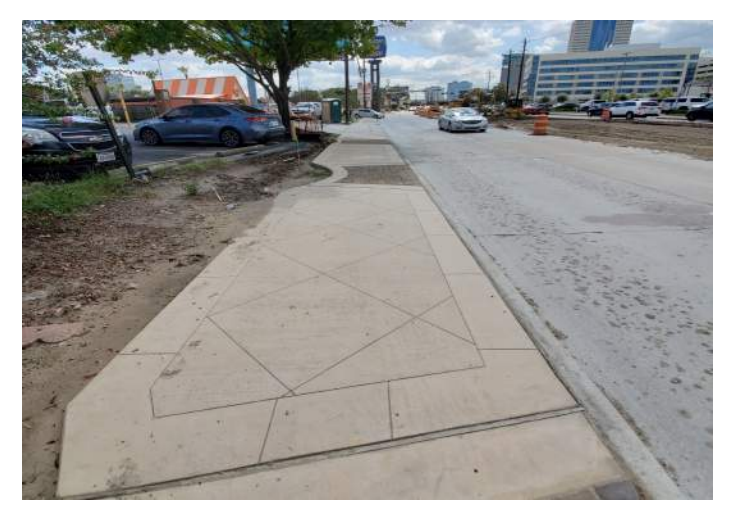
Sidewalk work ongoing on east side.

Forming work for inner travel lane (Phase 5 ) on east side.