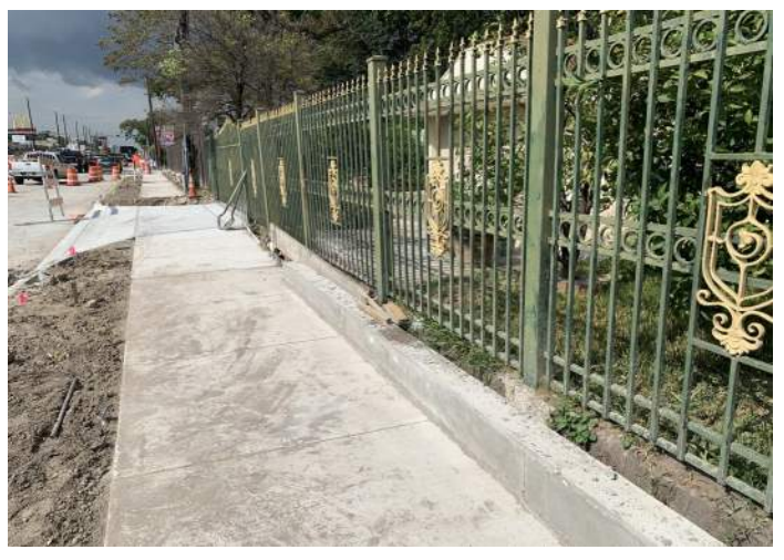
Completed Sidewalk and retaining wall on east side.