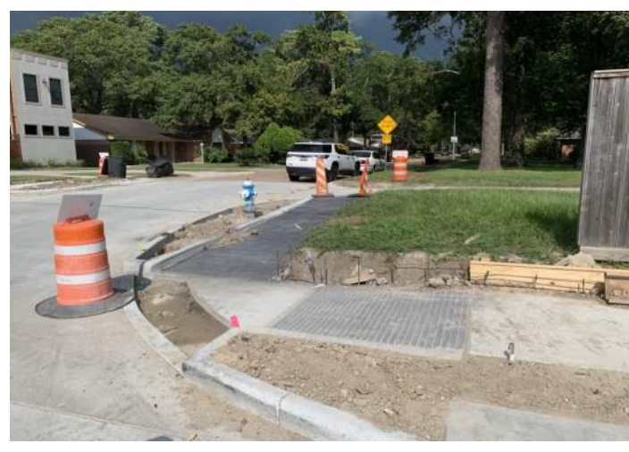
Ramp installation and retaining wall forming work