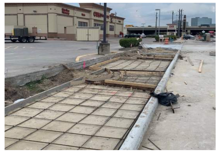
Forming work for sidewalk installation on east side.