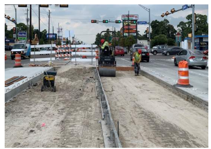
Soil compaction for travel lane - phase 5