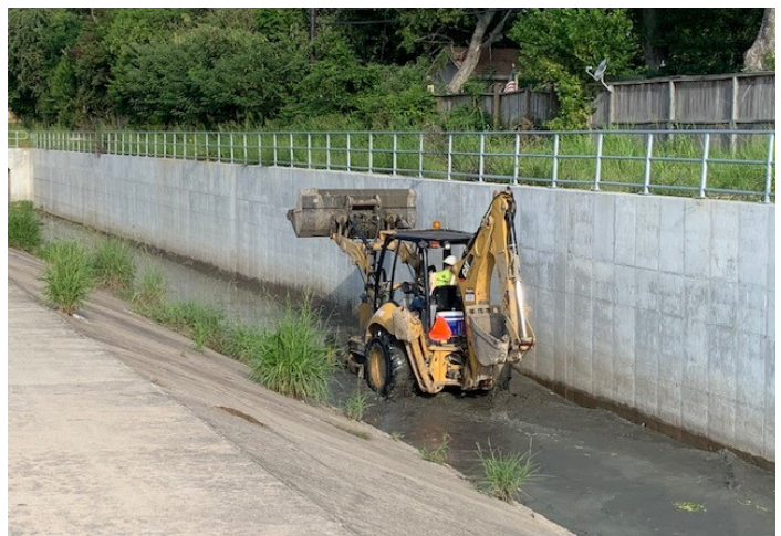
Cleaning W140 channel at the start of the project