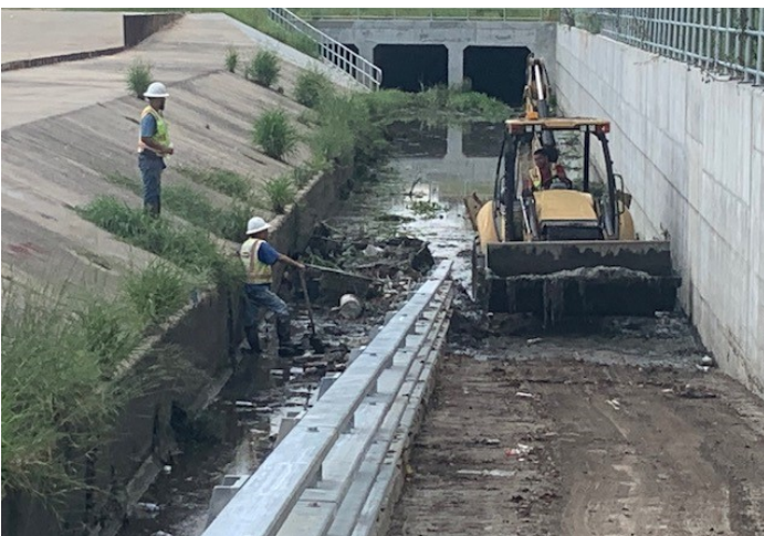
Cleaning W140 channel at the start of the project