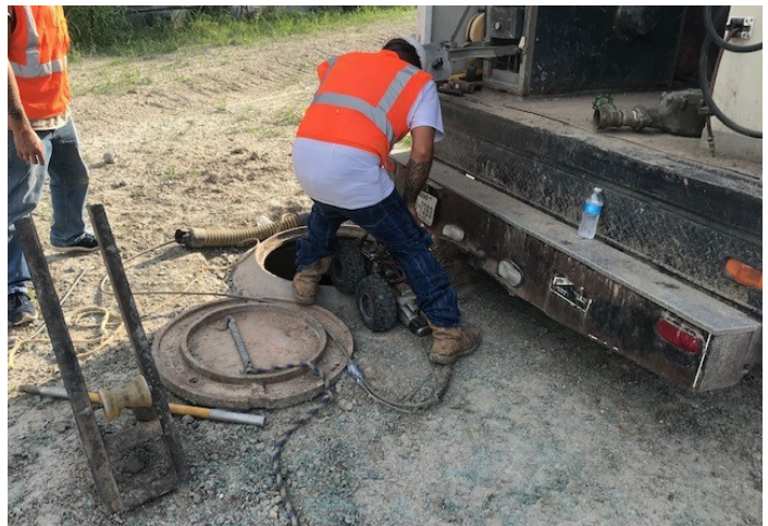
CCTV Crew Entering Storm Sewer.