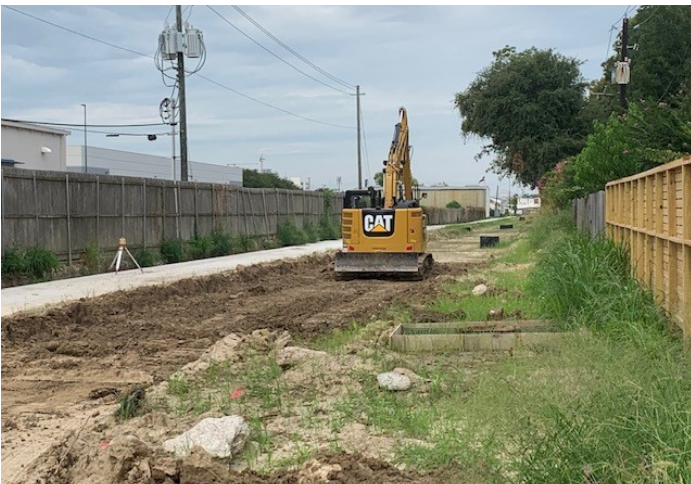
Final Grading on Phase II (Witte Road to Bunker Hill Rd)