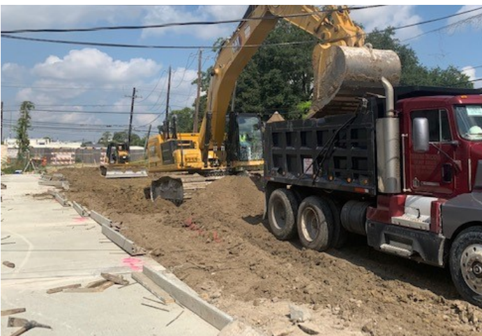
Began swale work next to Access Road