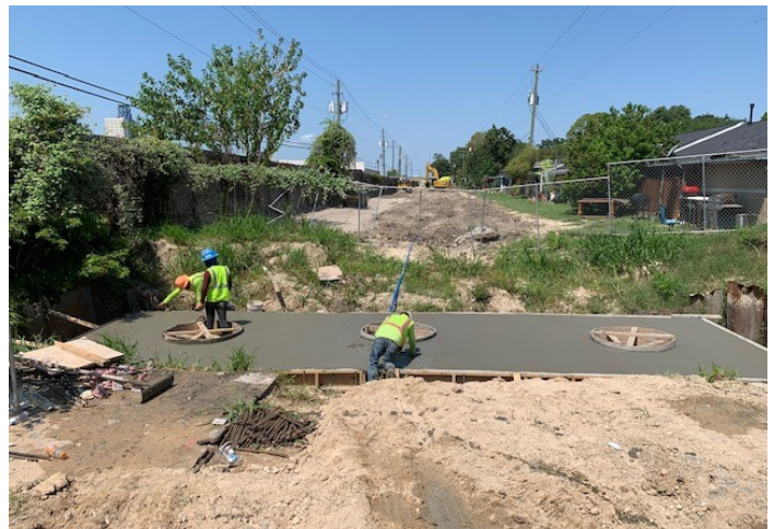
Finishing up Junction Box—Phase II.