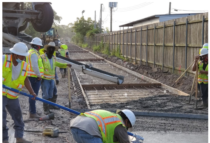
Concrete Pour work continues.