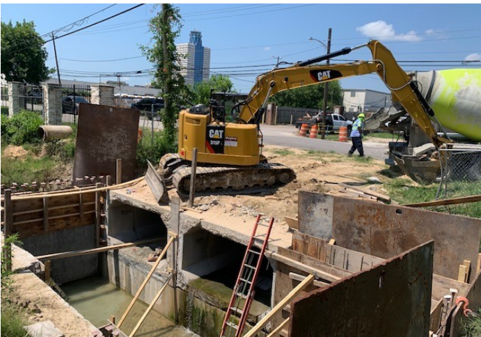
Pouring walls between the boxes at Junction Box at Witte Rd.