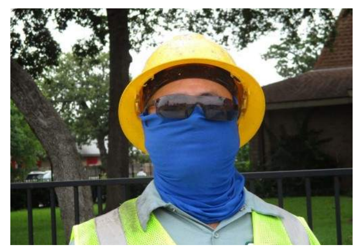
SER workers continue to comply with COVID-19 Guidelines.