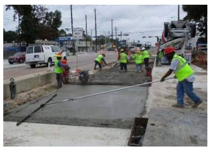
Concrete Pour on Northbound Lane 2.

Forming work for pavement installation on east side.