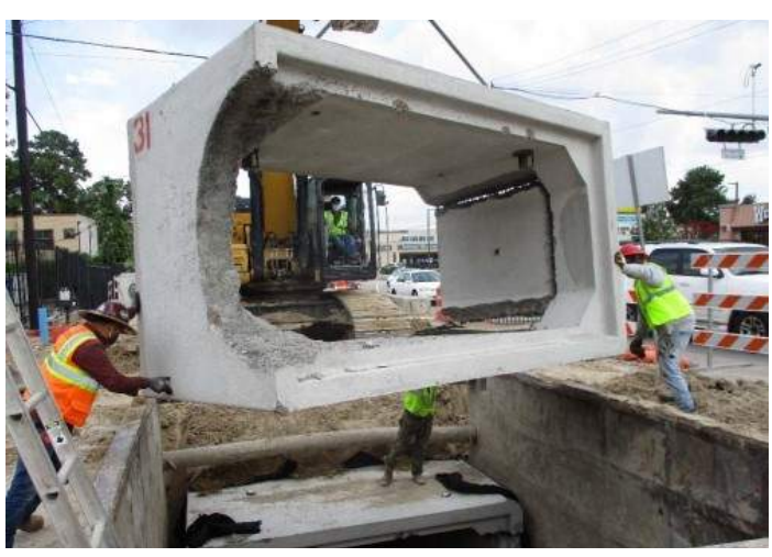
RCB installation on the east side of Gessner Rd