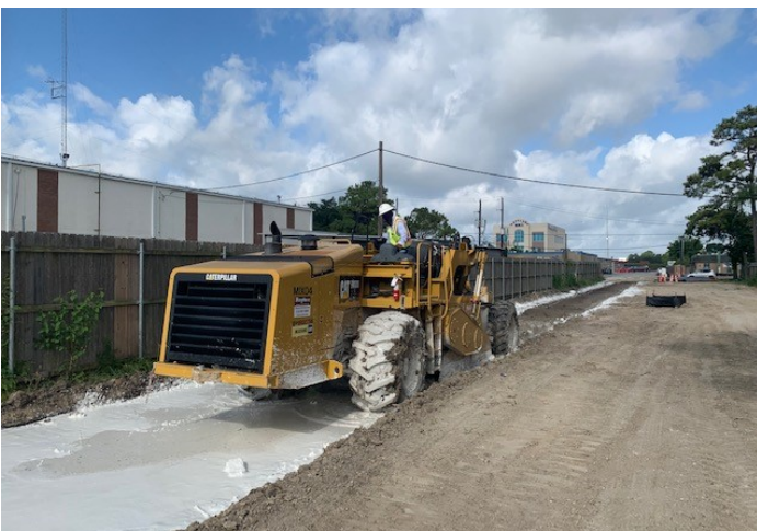
Mixing Lime Slurry (Soil Stabilization)