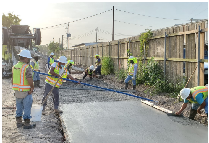
First Concrete Pour of Access Road between Gessner & Witte.