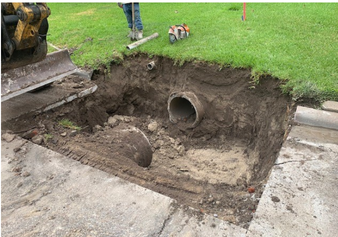
Preparing Straw 3 for inlets replacement.