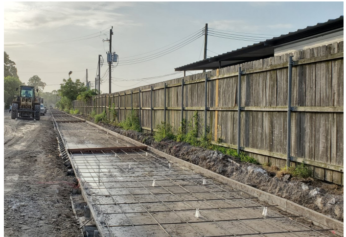
Forming of Access Road between Gessner and Witte