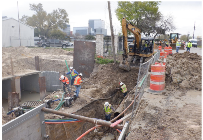
Lowering of 20" water line at Witte Road.