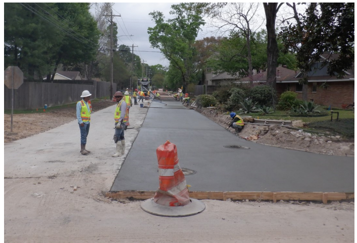
Pouring concrete on the east side of Windhover Lane (Straw 4)