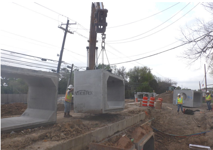
Installing 9' x 5' RCB at Witte Road