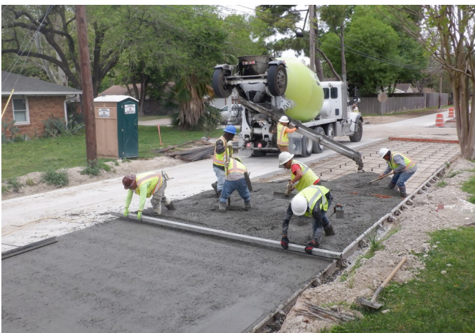
Pouring concrete on the east side of Windhover Lane (Straw 4)