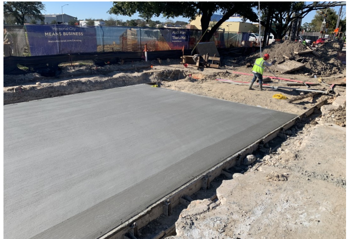
Pavement installation commenced.