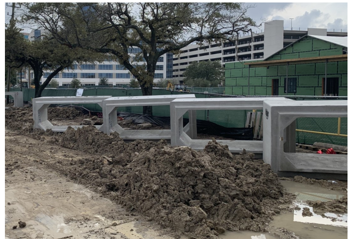
Stockpiled 10-FT x 5-FT RCBs