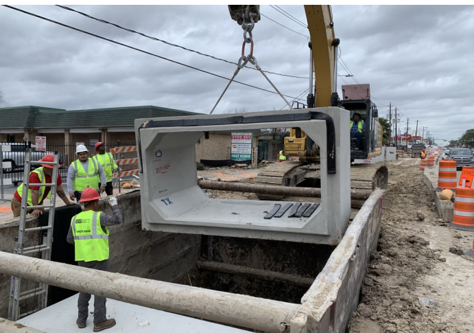
10-FT x 5-FT RCB Installation