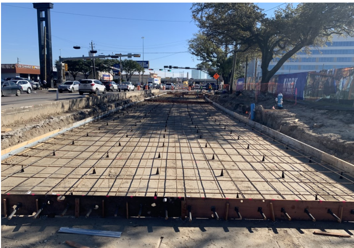
Forming and Rebar for pavement installation.