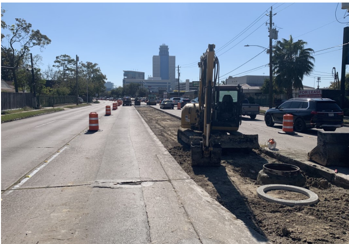
Removal of concrete medians