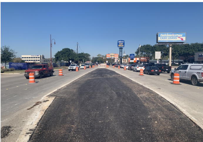
Asphalt installed in medians