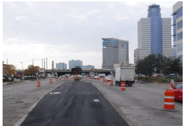
Current traffic control configuration