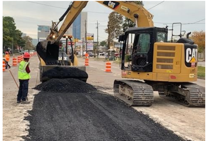
Laying asphalt in medians