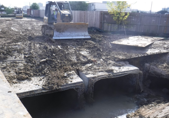
Preparing for junction box installation at Witte Rd.