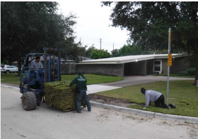
Placing sod on Springrock