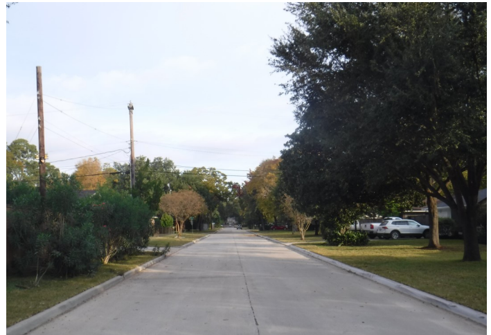
Finished sod on Springrock.