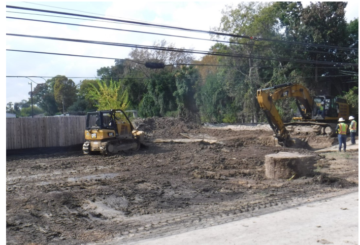
Backfill and cleanup along Witte Rd.