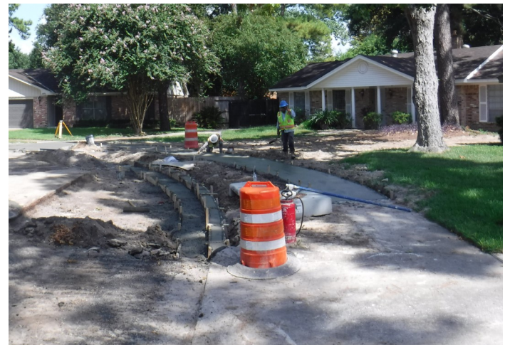
Installing sidewalk and dowel on curb on Larston St.—Straw 1