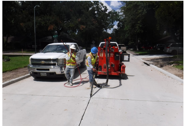
Sealant being installed on Springrock Lane—final pavement