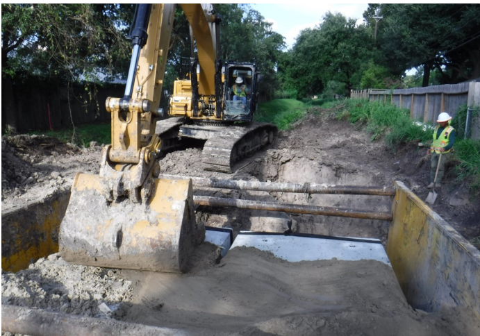
RCB installation west of Bunker Hill Road — Phase II