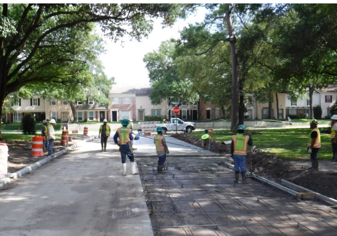
Repaving of Springrock Lane