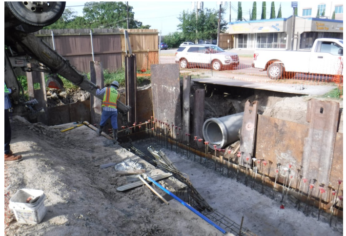
Pouring floor in junction box near Gessner Road