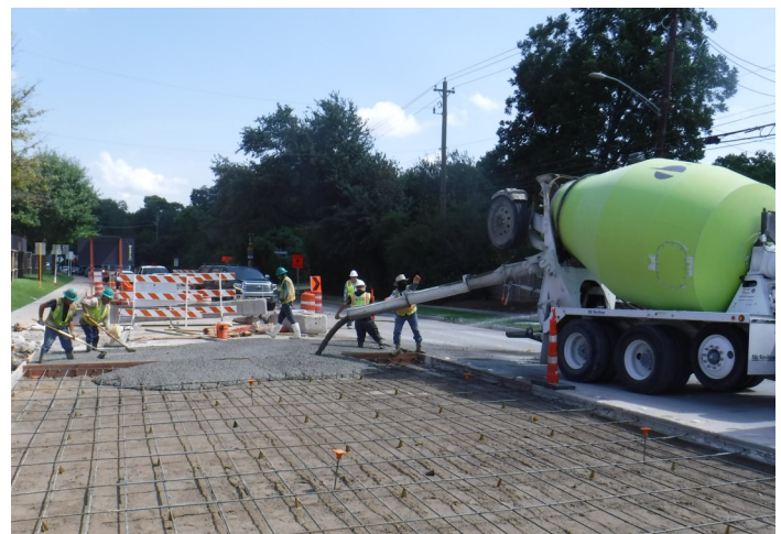
Repaving of Bunker Hill Road