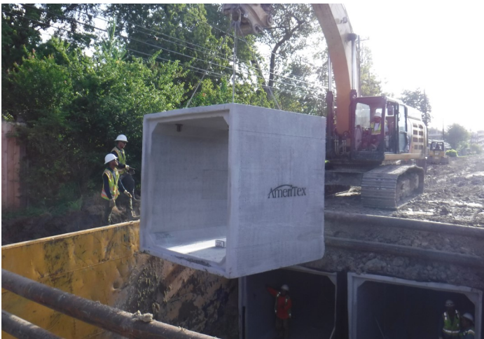
RCB installation west of Bunker Hill Road — Phase II