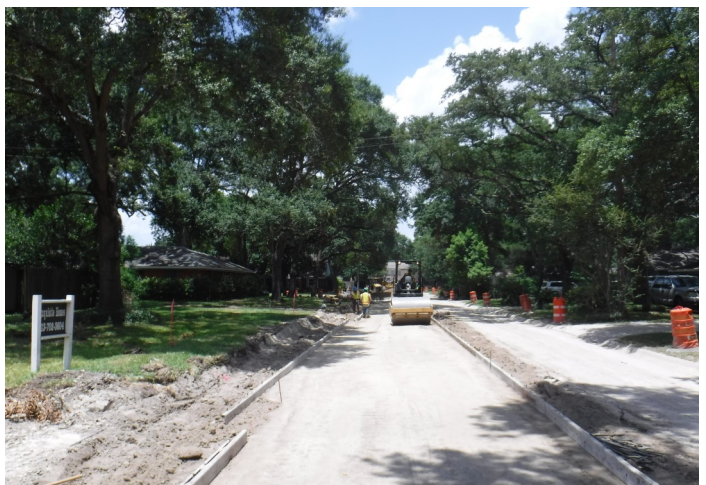
Final compaction before rebar placement on Springrock