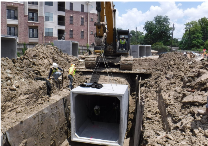
RCB installation west of Bunker Hill — Phase II.