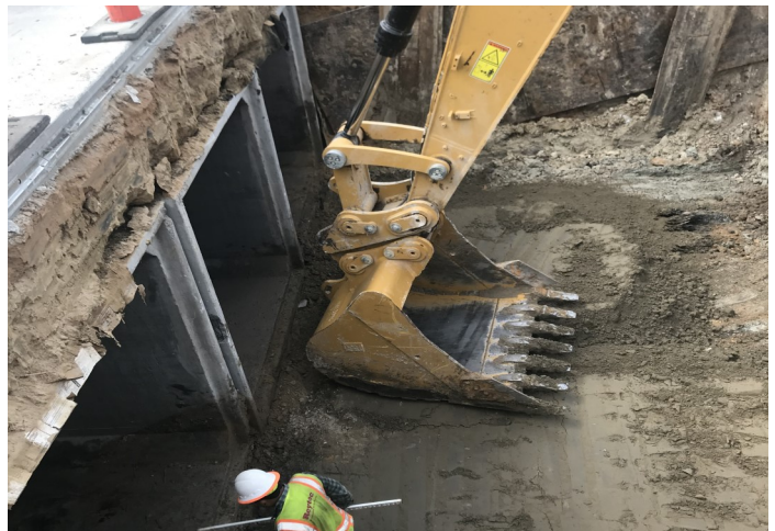
Three rows of RCBs at Bunker Hill Road Crossing.