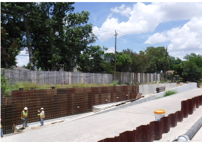
Retaining wall construction.