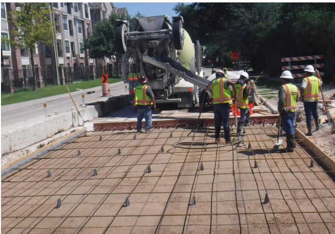
First concrete truck pour on Bunker Hill — east side.