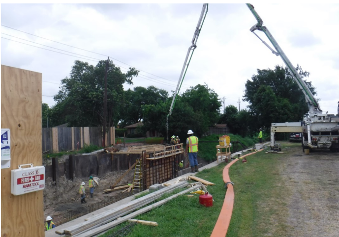
Pump truck used to pour retaining wall.