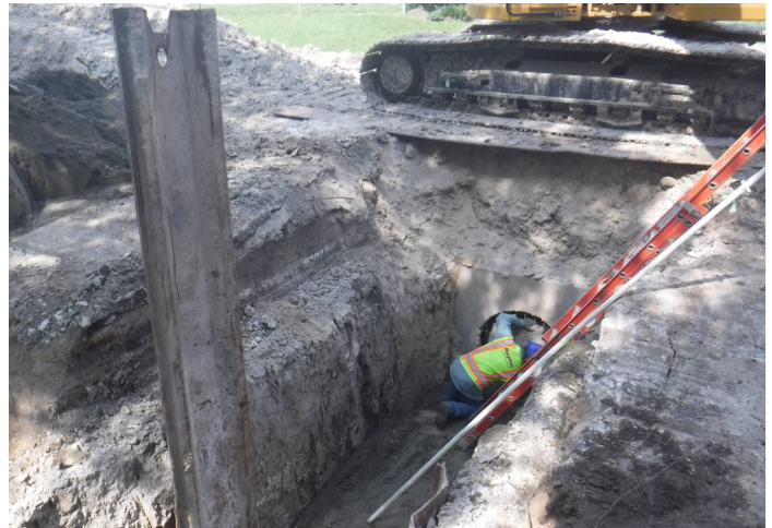
Inlet installation on straw five.