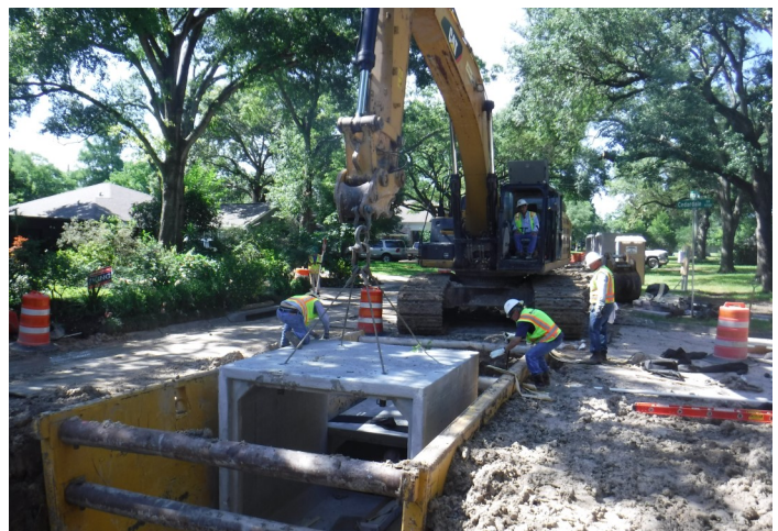
7x7 RCB installation on straw five.