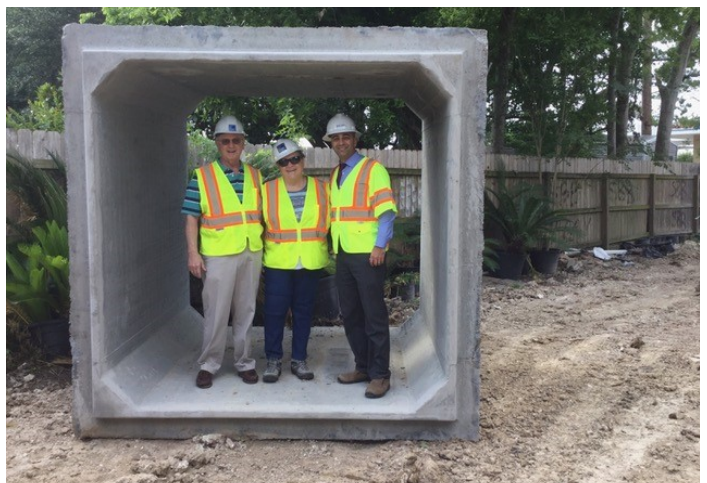
Board members/Engineer in 7'x7' RCB — 5/20/19 Site Tour