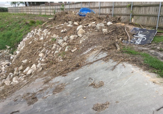
Debris cleared from west side of Bunker Hill crossing