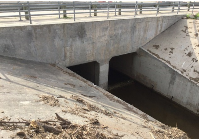
Existing crossing at Bunker Hill looking east cleared from Debris