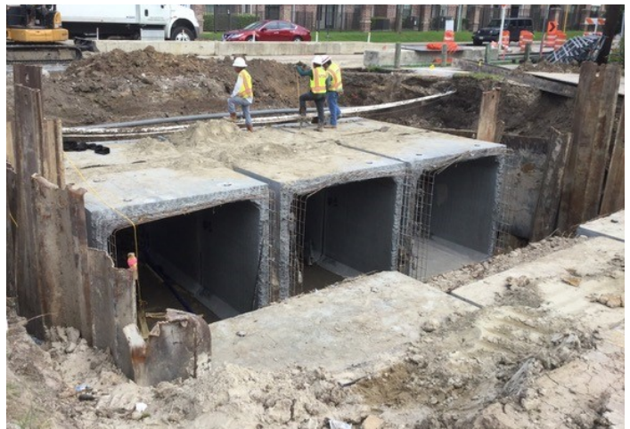
Three rows of RCBs installed at Bunker Hill crossing