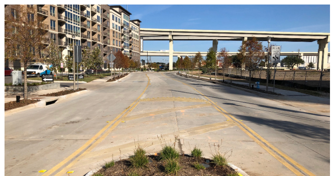
Town & Country Blvd. looking north