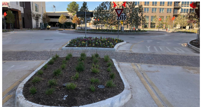
Town & Country Way looking west