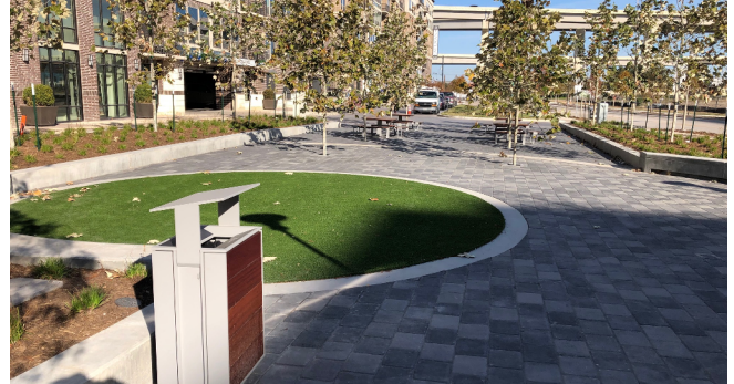
Plaza looking north