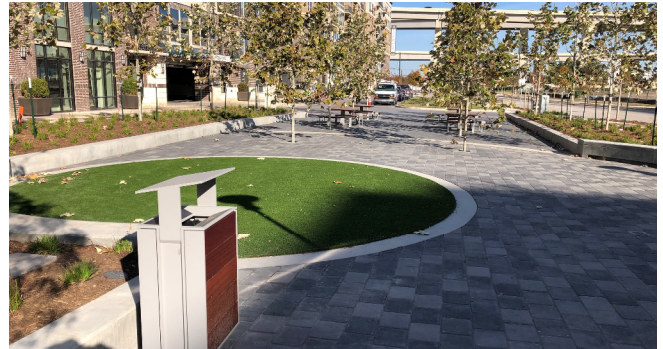
Plaza looking north