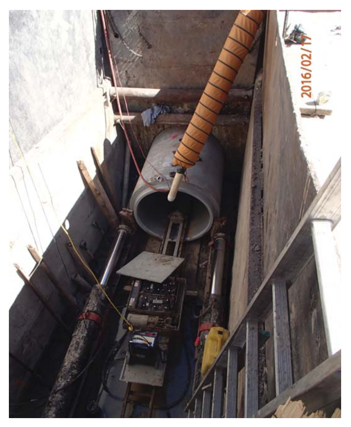
48-inch storm drain installation to Spillers Ln. cul-de-sac