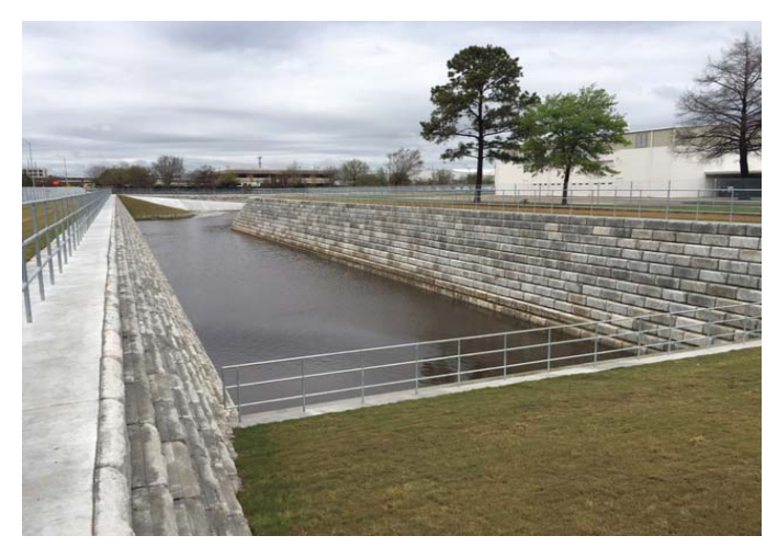
Basin after March 9 -10, 2016 rain event