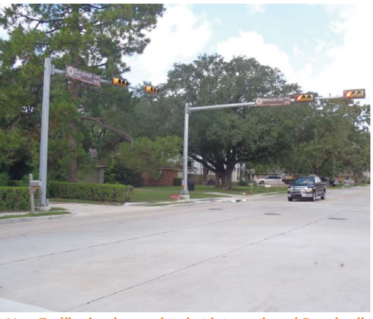
New Traffic signals completed at intersection of Barryknoll Lane and Memorial City Way