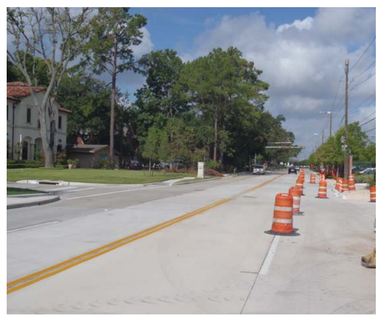
Barryknoll Lane open to two-way traffic - looking west