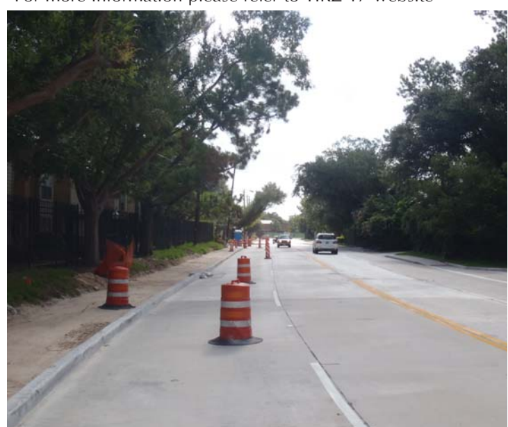
Barryknoll Lane open to two-way traffic - looking east

* For more information please refer to TIRZ 17 website