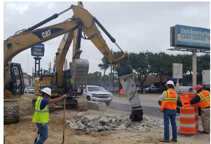
Ongoing Demolition Work