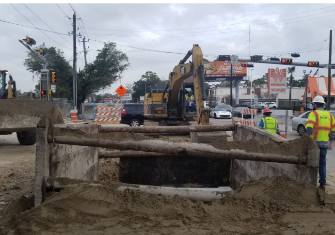
10-FT x 5-FT RCB Installation