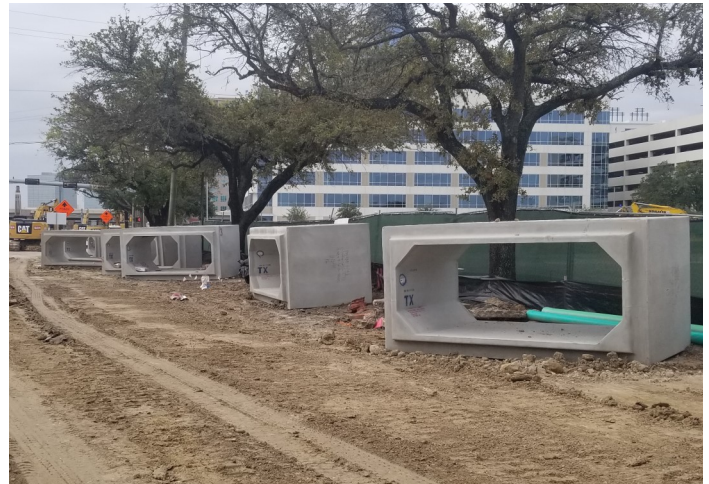
Stockpiled 10-FT x 5-FT RCBs