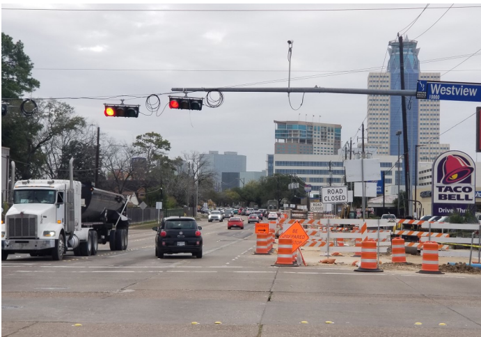
Current Traffic Control Plan, Work Zone—West side